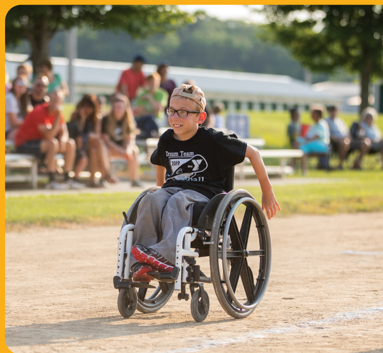
Dream Team T-Ball at the Caylor-Nickel Foundation Family YMCA gives those with all abilities the opportunity to participate and have fun.