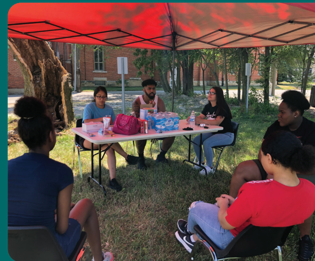
Youth Advocates talk about body positivity and healthy relationships.

The Youth Service Bureau offers a comprehensive range of counseling, mentoring, training and activities, centered around the physical, emotional and spiritual needs of our youth. Peer support groups, sports and exercise programs, and camps and service projects give youth the opportunity to build relationships and learn how to cope with life challenges in a healthy way. In 2019, more than 1,270 northeast Indiana youth participated in Youth Service Bureau programs.