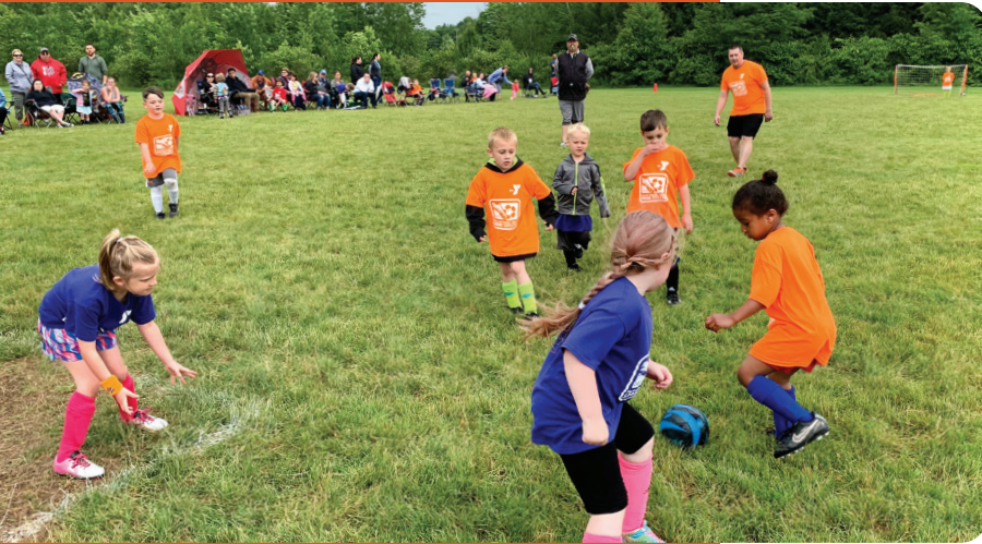
Spring soccer at the Parkview Family YMCA provides fun for all participants.