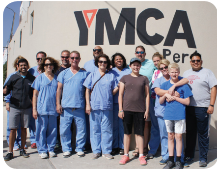
Team from August's trip to Arequipa, Peru.