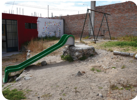
The existing YMCA facility when we visited last year (2016)