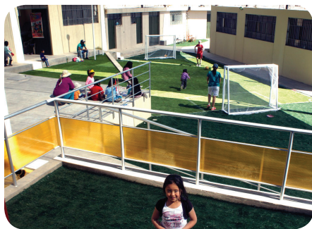
The upgraded YMCA facility now (2017).