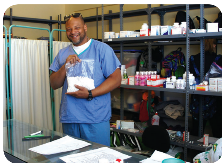
Stocked medical supplies in the clinic.